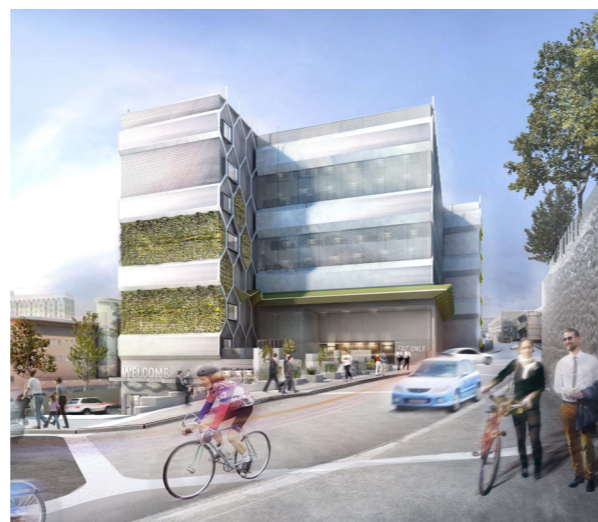
The hub's exit would be via Montague Hill South to provide a circular flow of traffic.