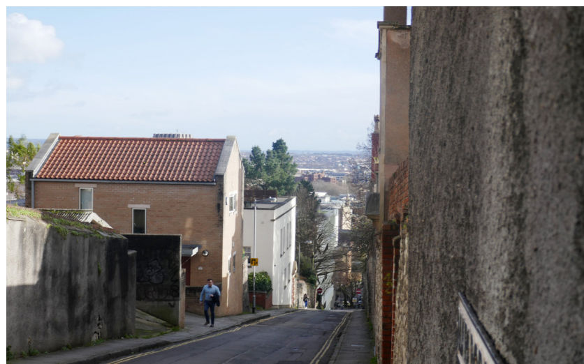
View from the top of Marlborough Hill where the hub would be obscured by surrounding buildings and would be barely visible.