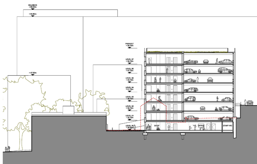
The outline shows the height of the Bristol Royal Infirmary in comparison with the height of the hub.