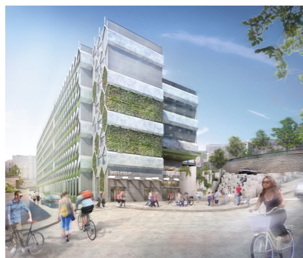
Vehicles, bicycles and transport services would enter the hub via Montague Street/ Eugene Street.