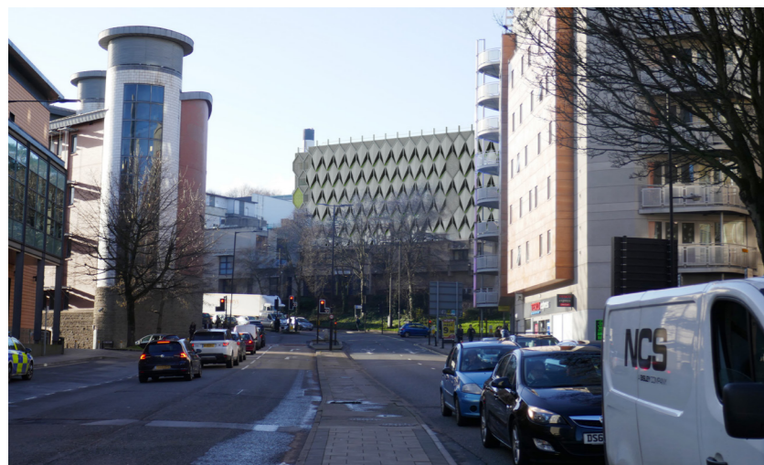
View of the hub from Marlborough Street facing north east.

The plans would respect and blend into its surroundings. The images below are impressions of what the new hub would look like.